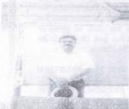
Ist Party न्यासकारी

Reg. No. 6934 Reg. Year 2011-2012 Book No. 4